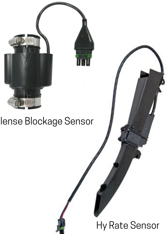
Vigilense Blockage Sensor