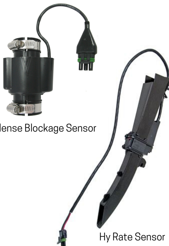
Vigilense Blockage Sensor