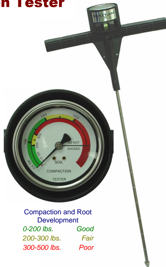
Compaction and Root Development 0-200 lbs. Good 200-300 lbs. Fair 300-500 lbs. Poor

Soil compaction can occur in any type of soil. Typically, after years of traffic, a 'plow pan' forms below the tillage zone. Traffic and tillage cause soil particles to become clustered together, filling up all available spaces, compacting into a hard layer that cannot be penetrated by moisture or roots.