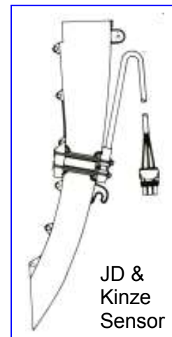
JD & Kinze Sensor