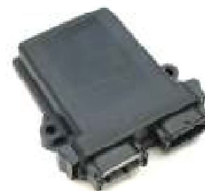
16 Row Flow Module

ASM II automatically recognises the presence of row sensors and tests each sensor every time the system is turned on.